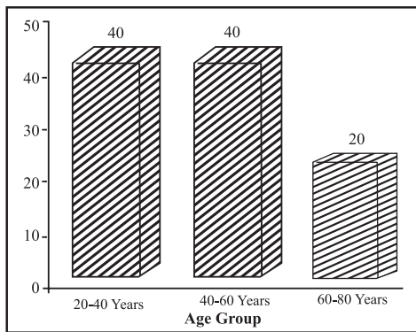
Fig. 1. Distribution of CKD 5 patients according to age group

Hypertension (HTN) was the leading cause of CKD 5 (54.0%) followed by diabetes mellitus (18.0%), idiopathic (13.0%) and glomerulonephritis (GN) (6.0%). Other causes of CKD 5 were obstructive uropathy (5.0%), reflux nephropathy (2.0%) and autosomal dominant polycystic kidney disease (ADPKD) (2.0%) (Fig 2).