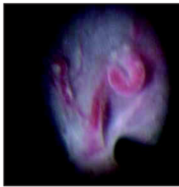
Fig. 3. Retina seen peroperatively