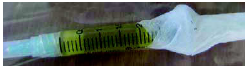
Fig. 2. Vitreous sample collected.

white moths in the environment; five patients were sure about no moth contact, while one was not sure.