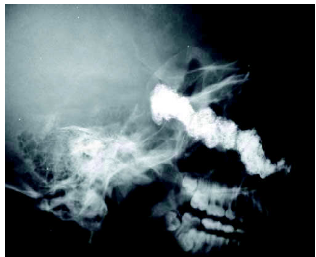
Fig. 3. Sphenoid along with nasal cavity was loosely packed with BIPP

Sphenoid sinus mucocoele even though rare, must be kept in mind in cases presenting with visual disturbances, proptosis and headache. Prompt investigation, diagnosis and early intervention in the form of surgery is required to avoid permanent visual disability.